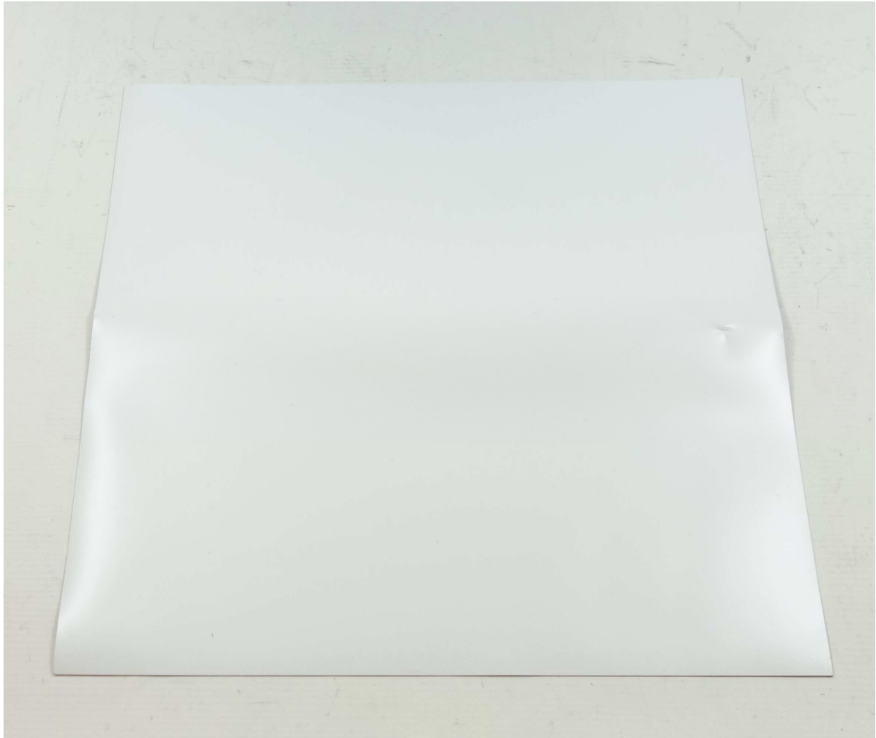
A001: Digital Magnetics Magnetic PVC Film